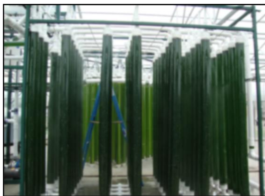
Figure 1 (left): Current photobioreactor installed at CAER

This project will demonstrate the potential of using waste CO 2 and heat from a coal-fired power plant to cultivate algae, which can then be processed into value-added products. A 50,000 gallon photobioreactor will be installed at Eastern Kentucky Power Cooperative's Dale Power Plant in Clark County, Ky to demonstrate the feasibility of an algae based CO 2 mitigation process. While the mitigation of CO 2 emissions from coal-fired power plants is the main focus of the project, in order to determine the most economically favorable strategy, the production of biofuels and other bioproducts will also be examined.